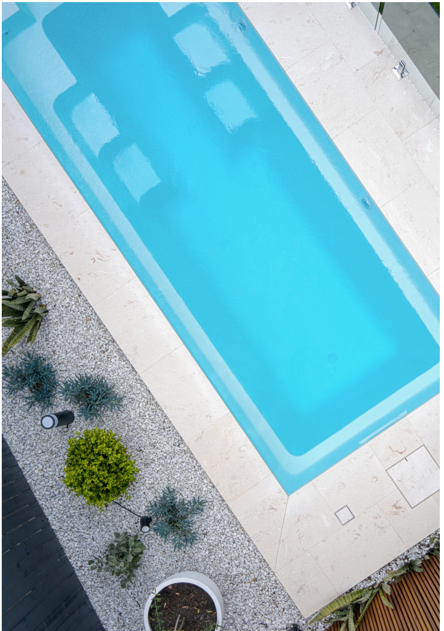
Product: Shell White Limestone Pavers & Matching Pool Coping @glazedco.sydney