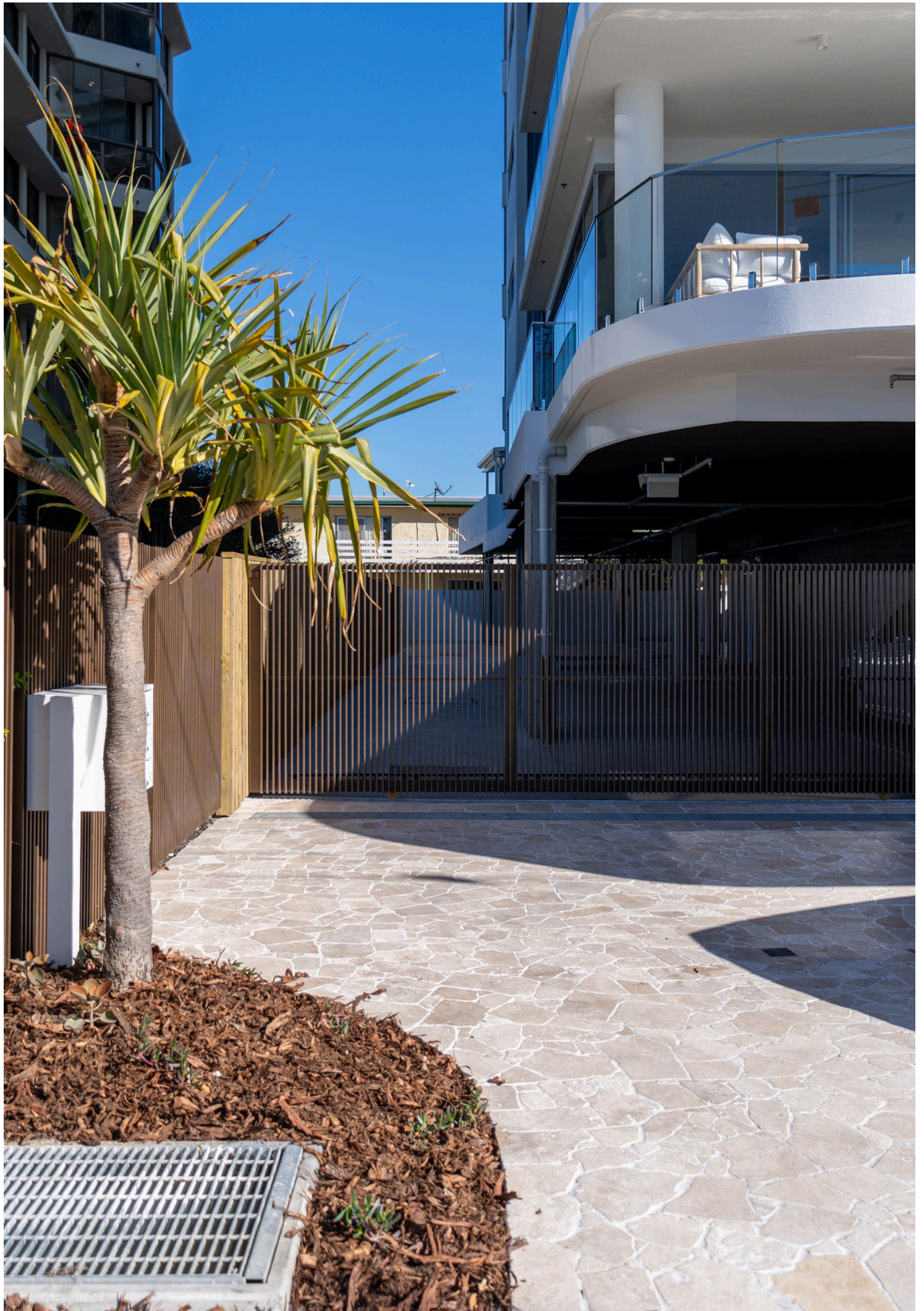
Product: Ivory Travertine Crazy Paving: @5pointprojects