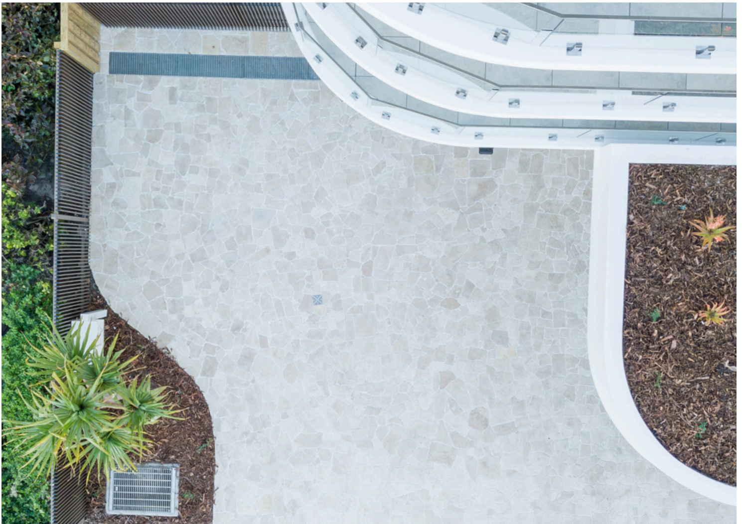
Product: Travertine Crazy Paving @5pointprojects