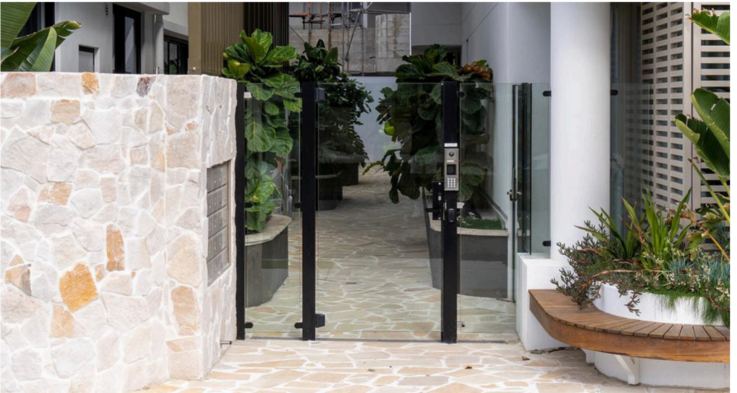
Product: Himalayan Sandstone Crazy Paving: @5pointprojects